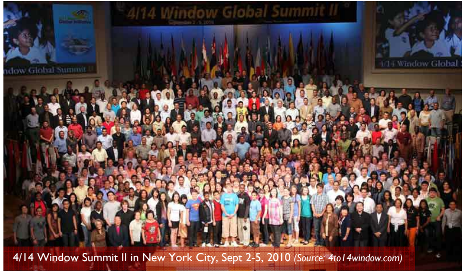
4/14 Window Summit II in New York City, Sept 2-5, 2010