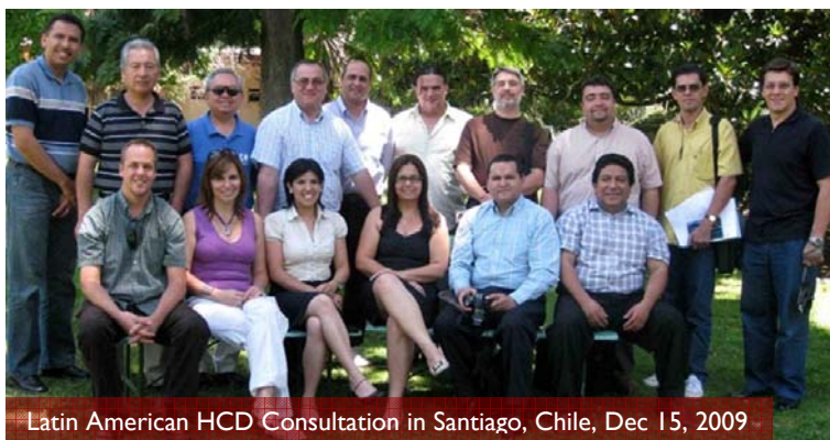
Latin American HCD Consultation in Santiago, Chile, Dec 15, 2009