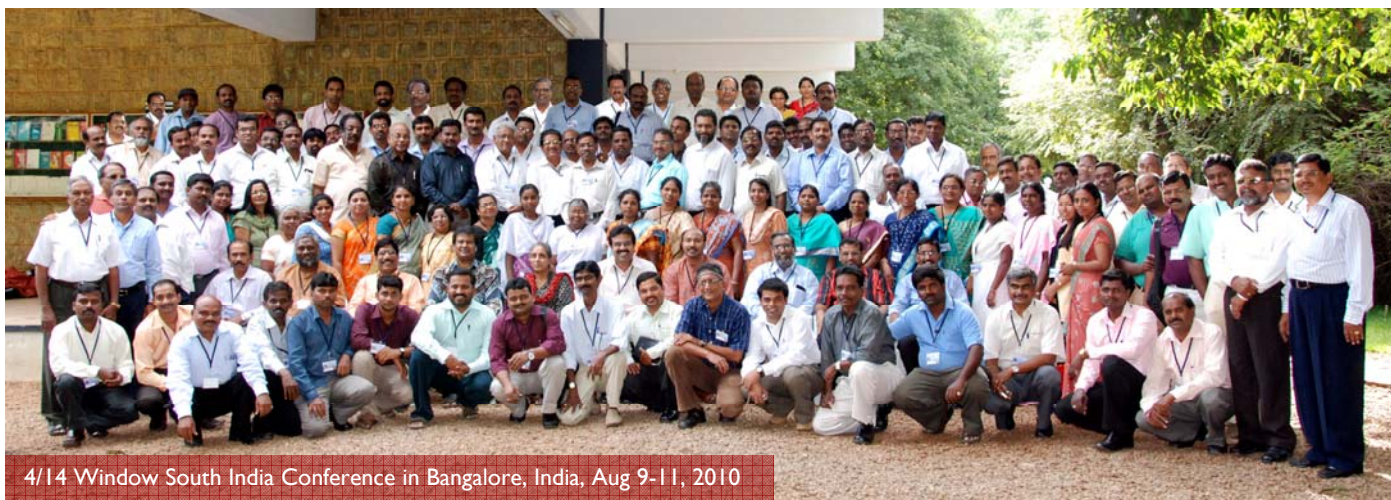
4/14 Window South India Conference in Bangalore, India, Aug 9-11, 2010

FROM Aug 9-11, 2010, about 150 Christian leaders from the South Indian States of Andhra Pradesh, Karnataka, Kerala and Tamil Nadu, came together in Bangalore, India for the 4/14 Window South India Conference . The conference was organized by the Centre for Contemporary Christianity (CfCC) and eight other organizations working with children in India to challenge local churches and NGOs to consider the needs and opportunities to reach children and youth in India. A key outcome was the plan to hold state-level 4/14 Window conferences in the four South Indian States. This coincides with ongoing effort to advance the 4/14 Window initiative in the North Indian States of Gujarat, Maharashtra, Orissa, Rajasthan, Uttar Pradesh, and West Bengal. Already, a