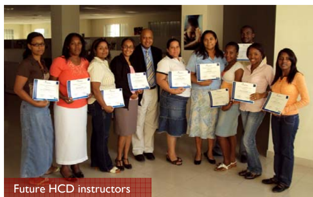
Future HCD instructors

AN intensive 8-month “ Defensoria de la Niñez ” diploma program in HCD, the first of its kind in the Dominican Republic, was jointly offered by the Universidad Nacional Evangélica (UNEV) and Compassion International in Oct 2009. In June 2010, 25 Christian leaders became the pioneer group of students to successfully graduate from the program. With the increase of interest in the program, 80 more new students began enrolling in Aug 2010.