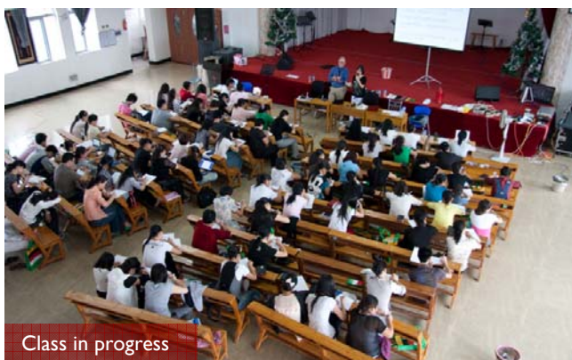
Class in progress