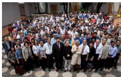
40th ATA Anniversary, Aug 2010

in Seminaries, as well as make a short presentation on HCD as one of the 'friends' of the ATA. The ATA have been very supportive of HCD development in their member seminaries, and it is always good to enjoy their company in gatherings like that.