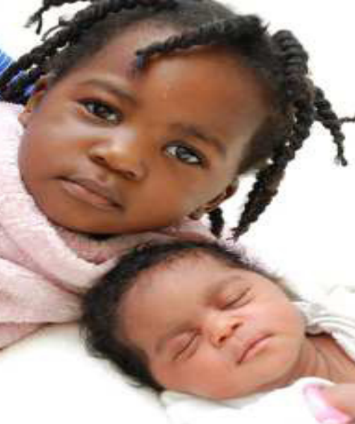
"Touching children, building nations"

Final papers should be submitted by August 30th, 2011 ; these should be a maximum of 25 pages in length (double-spaced, Times New Roman 12pt)