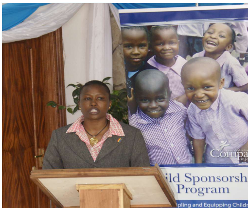
Promoting research, enhancing Child Policy