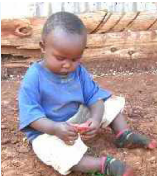
"A passion for Human Development"