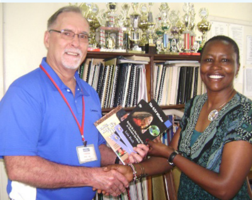
"Partnering to champion the cause for children"

- How can the interpretation and application of national and international legal institutional frameworks (i.e. the Convention on the Rights of Children, The Children Act 2002, Millennium Development Goals) be strengthened and supported to address the issues that affect children at risk in Africa?