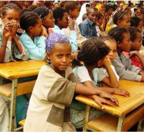
"Impacting children, one at a time"

Content scope should take consideration of national, regional or international contexts in the interpretation and application of child protection legal instruments.